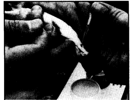
Figure 2. Obtaining a blood sample from each grass carp to be analyzed for triploidy.

clei. The lysed blood cells are immediately scanned for ploidy determination with an electronic particle counter, calibrated to read both diploid and triploid red blood cell nuclei volumes. Diploid grass carp have a red blood cell nuclei volume of 10.06 cubic micrometers ( \mu\text{m}^3 ), while the mean volume of triploid red blood cell nuclei is 14.82 \mu\text{m}^3 .